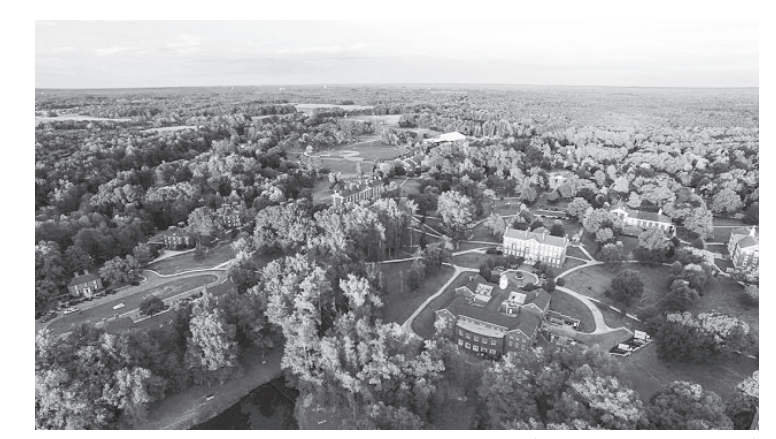
The site of the carnage