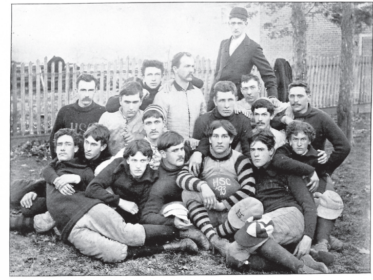
COLLEGE FOOT BALL TEAM

The 1893 Hampden-Sydney football team