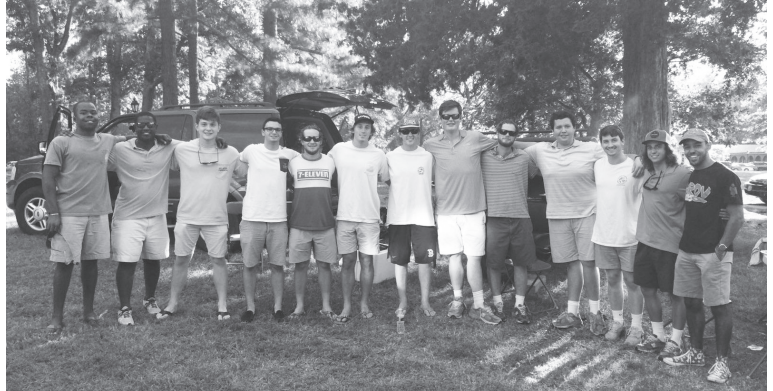
The No More Campaign Cookout in September