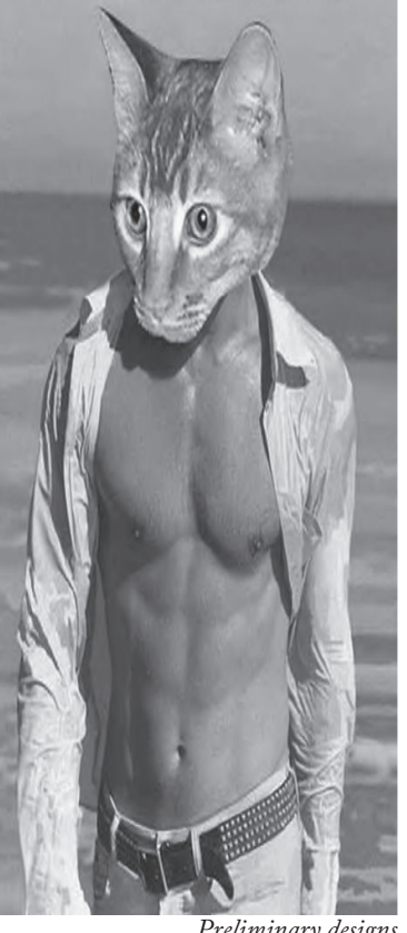
Preliminary designs

the cats themselves. "We then started the cats on a strict weightlifting regimen and a diet of keystone light and pizza box cheese" Girl says. The cats, according to McGee, were growing at an accelerated pace, and were benchpressing 135 pounds, shattering the school record of "the bar" set by a professors 12 year old son back in 1978. "The problem is that we messed up the ratio. We gave them too much Keystone, and the cats soon became too frat to want to play football" McGee says. This soon led to the cats sitting around all day, eating catnip and reading "The Cat in the Frat." With only a week to go before The Game, the project was abandoned, and a new set of cats was brought to work with. With such limited time, the researchers were forced to abandon the weightlifting regimen and train the cats to do figure eights around the Hampden-Sydney player's legs to try to trip them up or distract them. "They're not as strong as the first batch of cats was, but they're still much stronger than our football team" Girl says. "At least they don't run the other way when they receive the ball on kickoff."