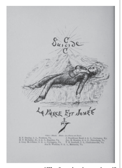
"The farce has been played"

Either there were some grand inside jokes amongst the members of the student body in 1894, or it was a strange school year indeed.